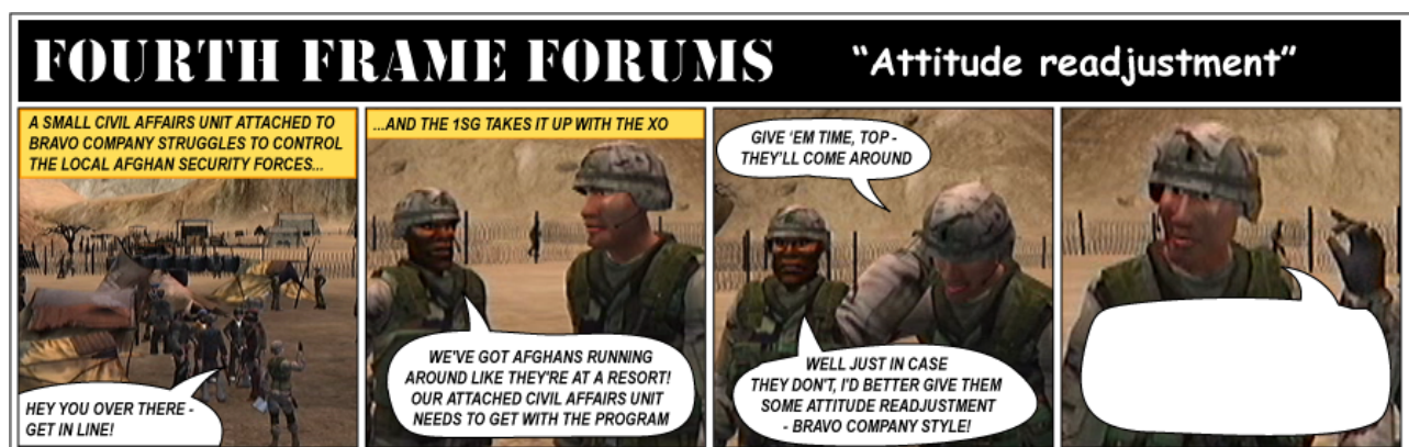
Figure 2. An example Fourth Frame Forum episode

The final step in authoring an episode was to realize the episode description as a four frame graphical comic using the conventions of the genre [7]. Artistically inclined developers may choose to hand-draw the episodes in the traditional manner of comic strip creation, whereas others may find it easier to start with photographs of posed character models that can be edited using commercial drawing applications. In developing four example Fourth Frame Forum episodes in support of US Army leadership development, we chose to start with single frames of a series of machinima-style cut-scene videos of 3D virtual characters taken from an existing training application [3]. Individual video frames were selected that approximated the intended descriptions of each comic frame, cropped to focus on the relevant characters and