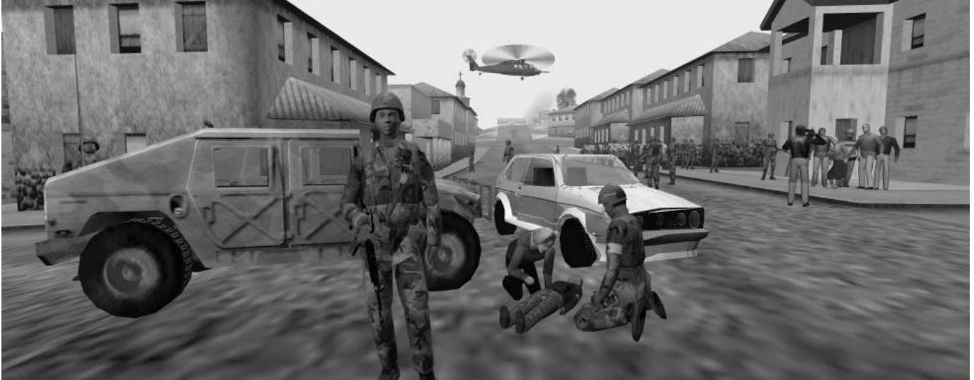
Figure 1: Virtual Bosnian village

perienced a flash of insight in our research that leaves us with intense feelings of joy, only to be crestfallen seconds later by the realization of some crucial flaw. Emotions clearly have a strong influence over our decision-making abilities as well (Damasio 1994; Sloman, 1987).