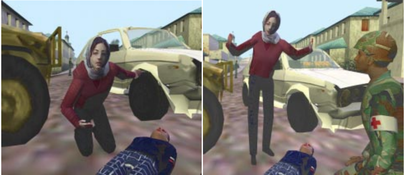
Figure 4: Subdued and angry variants of imploring the lieutenant

stress and anxiety. She transitions back to body focus, which is articulated physically through visible and audible weeping.