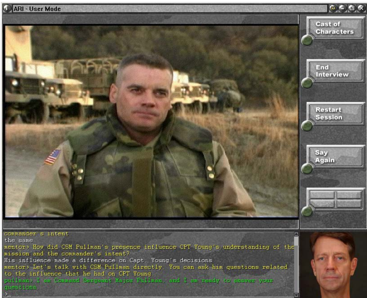
Figure 1. A screenshot of Think Like a Commander – Excellence in Leadership (TLAC-XL)

While we call the interaction between the student and the mentor and the student and the characters a "conversation," it is really a scripted interaction that