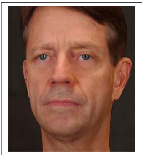
Figure 5. Synthetic Mentor

Realistic animation of a synthetic human is a difficult task due to the complexity of the human body, one that traditionally involves many digital artists in the special effects industry. We took advantage of motion capture technology to bring realism into the synthetic mentor at an affordable cost. Motion capture allows the accurate recording of live actors' motions. We used this technology to record a large database of speech related motions from a live actor. We then analyzed this data to build a generative statistical model of these actor's facial motions. This model used the database of motions indexed with speech. We organized this database according to the phonemes of the recorded speech: each phoneme is associated with a large number of motion fragments.