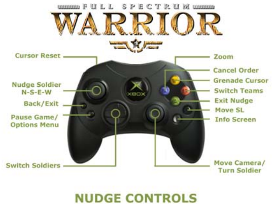
Figure 5: Nudge interface command set

Nudge commands are limited: it was deemed unrealistic to give players the ability to move Soldiers around like chess pieces. A nudge can move a Soldier a few inches, change his individual cover sector or rotate him. The nudge interface command set is shown in Figure 5.