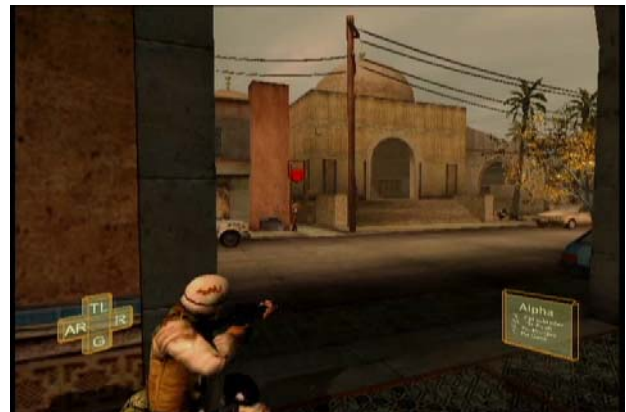
Figure 6: Red icon revealing OPFOR

One interesting challenge arose from the resolution limitations of standard definition television display: optimally, 640 X 480. In the subtended field of view depicted on the main application screen, OPFOR would normally be visible in the mid far range depicted in the simulation. The solution was an iconic widget that floats over the distant OPFOR (see Figure 6) highlighting a character who might not otherwise be seen in this lower-resolution display.