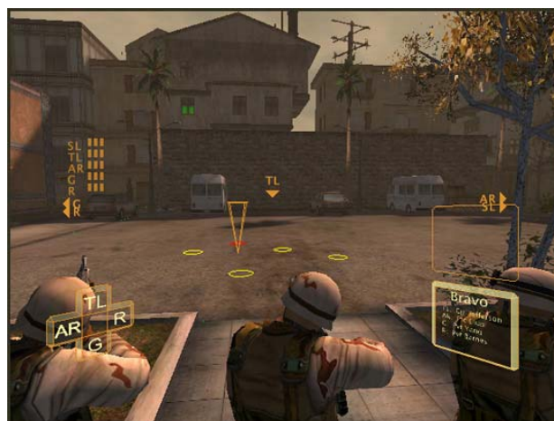
Figure 2: Action Cursor shown on street

The solution to the challenge of creating meaningful interaction with the simulation's entities came in part from what was dubbed the "Action Cursor". Moving the left joystick in FSW instantiates a cursor which anticipates movement orders from a Squad Leader to a Fire Team. These choices include an Object Formation, Corner Formation, Door Formation, Breach Door/Building, etc., and are derived from the physical context of the cursor orientation (see Figure 2).