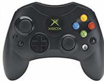
Figure 1: Xbox Controller S

A standard Xbox controller has two thumb-controlled joysticks, a directional key, two proportional trigger keys (mounted below) and eight pushbuttons: two left and six right. There is no keyboard and consequently no convenient way to enter text. There is no mouse, so pointing and clicking, while possible, is more awkward than with desktop and laptop systems (see Figure 1):