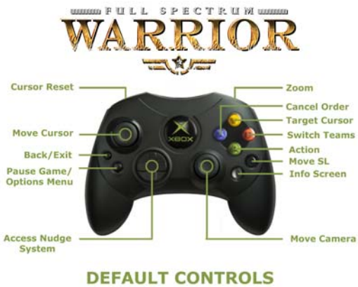
Figure 3: FSW default controls

holding the “A” button during a movement order. The full interface command set is shown in Figure 3.