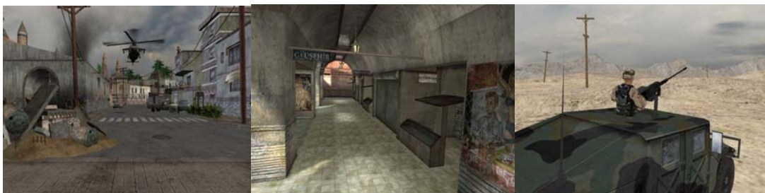
Figure 4. Scenes from the Virtual Iraq exposure therapy application for combat-related PTSD

For example, Phloem will be integrated into an ongoing clinical application project that is targeting the treatment of Post Traumatic Stress Disorder in returning Iraq and Afghanistan military personnel (Rizzo et al., 2005). In this application, designed to deliver graduated exposure therapy within the context of VR scenarios that resemble combat-related settings (see Figure 4), clinicians have the capacity to deliver real time trigger stimuli while monitoring the ongoing physiological status of the client on the same interface. This integrated interface and data