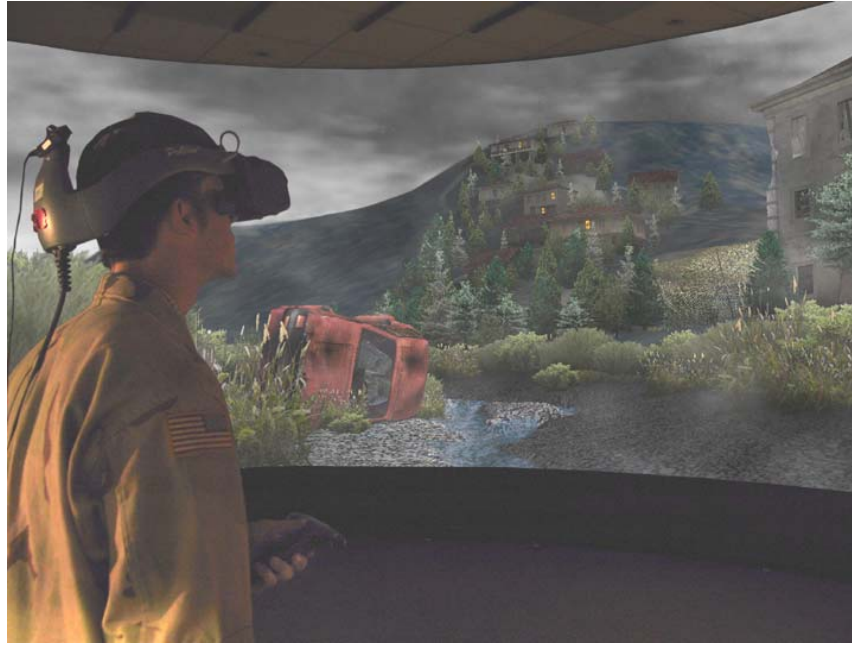
Figure 1: A participant in the HMD and a scene from the VE experiment world: DarkCon

The experiment required each subject to play the role of a forward scout in a military-style scenario, and to determine whether rebels or refugees inhabit an area of suspicion. In this regard, the mission (as described in the priming videos) is basically an observational exercise, but we add a simple objective of dropping a GPS transmitter near a specific building if enough clues indicate that rebels are inhabiting the target area. Because this virtual mission takes place at night we have named it DarkCon (see Figure 1).