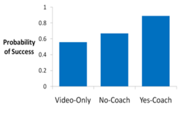
Figure 2. Probability of success by condition.

Fourth meeting. Three participants – one from each condition – were omitted from this analysis because of experimenter error. As a result, this analysis included a total of 27 participants (nine per condition). Figure 2 presents the success data from our experiment. As can be seen, the combination of interactive gameplay and feedback from the coach helped players to