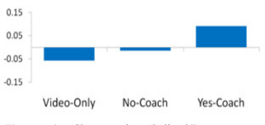
Figure 4. Changes in "ballpark" score on meeting-phase-specific prompts (by condition)

reflect the inadequacy of discovery (i.e., trial-and-error) learning. Without guidance from the coach or a model of ideal gameplay, which was present in the video-only condition, players in the no-coach condition are left to wander through the action menus. It appears this unguided activity is unproductive.