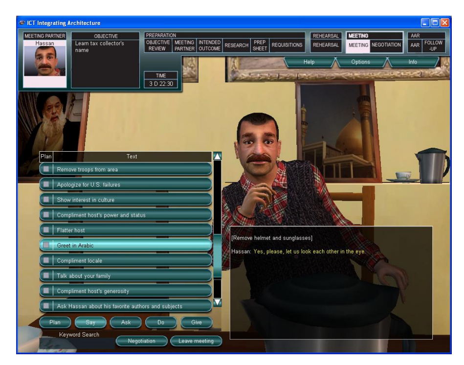
Figure 1. The ELECT BiLAT meeting screen. Learners select communicative actions from the menu on the left and see and hear the character's animated response. The dialogue is recorded in the textbox in the lower right corner. Coaching utterances also appear in this box.

(and the resulting virtual humans) may open new avenues for teaching the cognitive and interpersonal aspects of learning about different cultures.