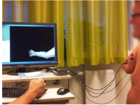
Fig. 13.1 Virtual hand controlled by an amputee via pattern recognition of myoelectric signals

Input devices are important for each VR system to provide the user with intuitive ways to control events within virtual environments. Examples of commercial devices include standard PC peripherals such as: keyboard, mouse and joystick; posture platforms; marker-based motion capturing and tracking systems (e.g. OptiTrack), infrared light (e.g. Microsoft Kinect, ARTTRACK3), instrumented gloves (e.g. AcceleGlove and CyberGlove) and inertia trackers in handheld devices (e.g. accelerometer/gyroscopes in smart phones or the Nintendo Wii); and more recently, brain-computer interfaces (BCIs) that detect electroencephalography patterns of the user (e.g. Emotiv Epoc). On the research side, the prediction of motion intent based on patterns of myoelectric activity is also used as input for VR systems (Ortiz-Catalan et al. 2013). Figure 13.1 shows a transhumeral amputee controlling a virtual hand through pattern recognition of the myoelectric activity recorded on the surface of the subject's stump (Fig. 13.1).