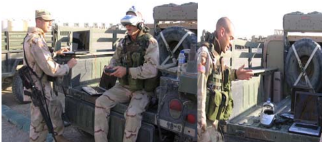
Figure 5. User Centered Feedback from Iraq Stress Control Team

exposed to scripted researcher-initiated VR trigger stimuli to simulate an actual treatment session. SMs then completed standardized questionnaires to evaluate the realism, sense of “presence” (the feeling of being in Iraq), sensory stimuli, and overall technical capabilities of Virtual Iraq . Items were rated on a scale from 0 (Poor) to 10 (Excellent). Qualitative feedback was also collected to determine additional required software improvements. The results suggested that the Virtual Iraq environment in its form at the time was realistic and provided a good sense of “being back in Iraq”. Average ratings across environments were between adequate and excellent for all evaluated aspects of the virtual environments. Auditory stimuli realism ( M=7.9 ; SD=1.7 ) and quality ( M=7.9 ; SD=1.8 ) were rated higher than visual realism ( M=6.7 ; SD=2.1 ) and quality ( M=7.0 ; SD=2.0 ). Soldiers had high ratings of the computer’s ability to update visual graphics during movement ( M=8.4 ; SD=1.7 ). The eMagin HMD was reportedly very comfortable ( M=8.2 ; SD=1.7 ), and the average ratings for the ability to move within the virtual environment was generally adequate or above ( M=6.1 ; SD=2.5 ). This data, along with the collected qualitative feedback, was used to inform upgrades to the current version of Virtual Iraq that is now in clinical use and this “design-collect feedback-redesign” cycle will continue throughout the lifecycle of this project.