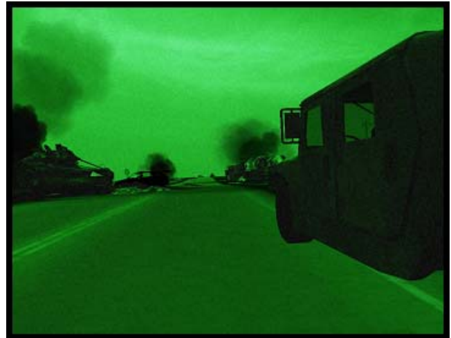
Figure 3. Night Vision Setting

Both the city and HUMVEE scenarios are adjustable for time of day or night, weather conditions, illumination, night vision (see Figure 3) and ambient sound (wind, motors, city noise, prayer call, etc.). Users can navigate in both scenarios via the use of a standard gamepad controller, although we have recently added the option for a replica M4 weapon with a “thumb-mouse” controller that supports movement during the city foot patrol. This was based on repeated requests from Iraq experienced SMs who provided frank feedback indicating that to walk within such a setting without a weapon in-hand was completely unnatural and distracting! However, there is no option for firing a weapon within the VR scenarios. It is our firm belief that the principles of exposure therapy are incompatible with the cathartic acting out of a revenge fantasy that a responsive weapon might encourage.