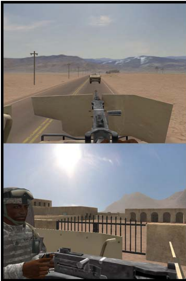
Figure 8. Scenes from Virtual Afghanistan HUMVEE Turret Position

• expansion of the functionality of the existing Virtual Iraq system based on the results of ongoing and future research. This will involve refining the system in terms of the breadth of scenarios/trigger events, the stimulus content and the level of Artificial Intelligence of virtual humans that “inhabit” the system.