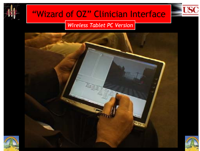
Figure 4. “Wizard of Oz” Clinical Interface

In addition to the visual stimuli presented in the VR Head-Mounted Display (HMD), directional 3D audio, vibrotactile and olfactory stimuli can be delivered into the VR scenarios in real-time by the clinician. The presentation of additive, combat-relevant stimuli in the VR scenarios can be controlled via a separate “Wizard of Oz” control panel, while the clinician is in full audio contact with the patient (see Figure 4).