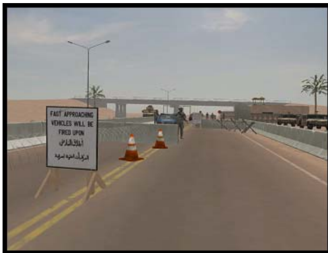
Figure 2. Desert Road Checkpoint

Both the city and HUMVEE scenarios are adjustable for time of day or night, weather conditions, illumination, night vision (see Figure 3) and ambient sound (wind, motors, city noise, prayer call, etc.). Users can navigate in both scenarios via the use of a standard gamepad controller, although we have recently added the option for a replica M4 weapon with a “thumb-mouse” controller that supports movement during the city foot patrol. This was based on repeated requests from Iraq experienced SMs who provided frank feedback indicating that to walk within such a setting without a weapon in-hand was completely unnatural and distracting! However, there is no option for firing a weapon within the VR scenarios. It is our firm belief that the principles of exposure therapy are incompatible with the cathartic acting out of a revenge fantasy that a responsive weapon might encourage.