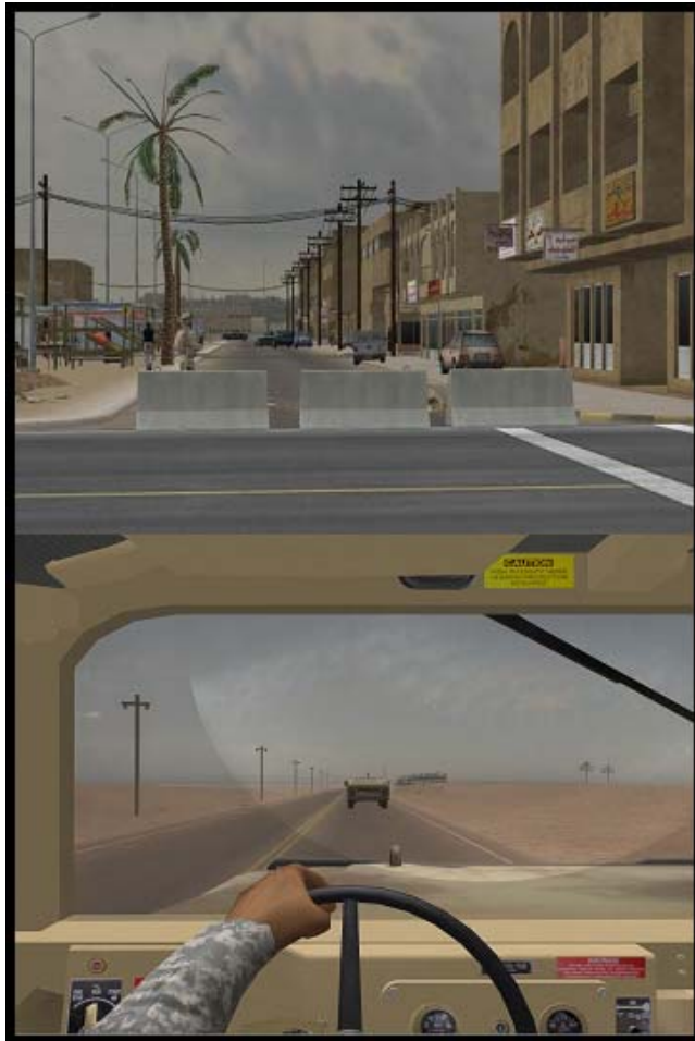
Figure 1. Scenes from Virtual Iraq City and Desert Road HUMVEE interior

a convoy or as a lone vehicle with selectable positions as a driver, passenger or from the more exposed turret position above the roof of the vehicle. The number of soldiers in the cab of the HUMVEE can also be varied as well as their capacity to become wounded during certain attack scenarios (e.g., IEDs, rooftop/bridge attacks).